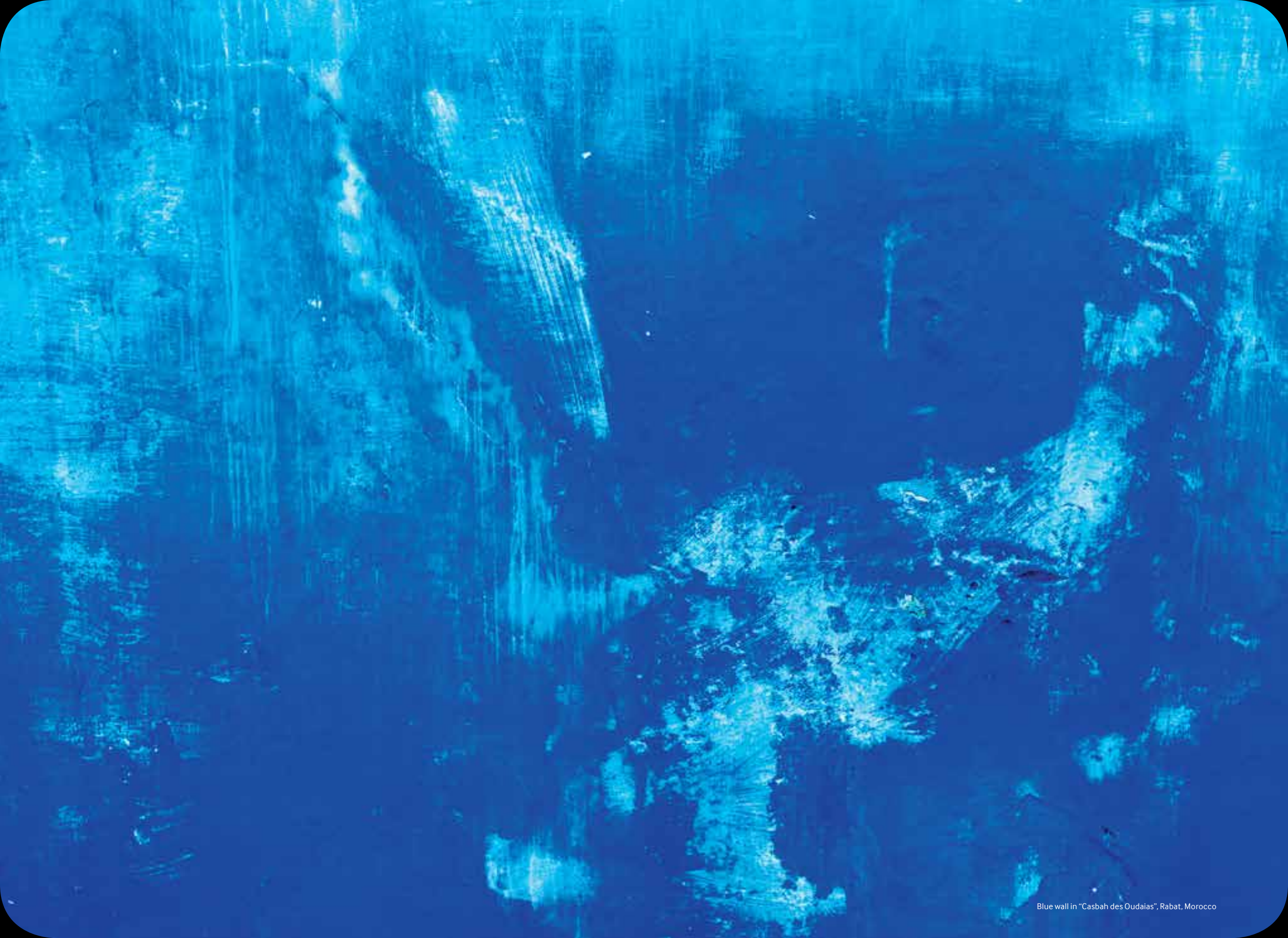
Blue wall in "Casbah des Oudaias", Rabat, Morocco