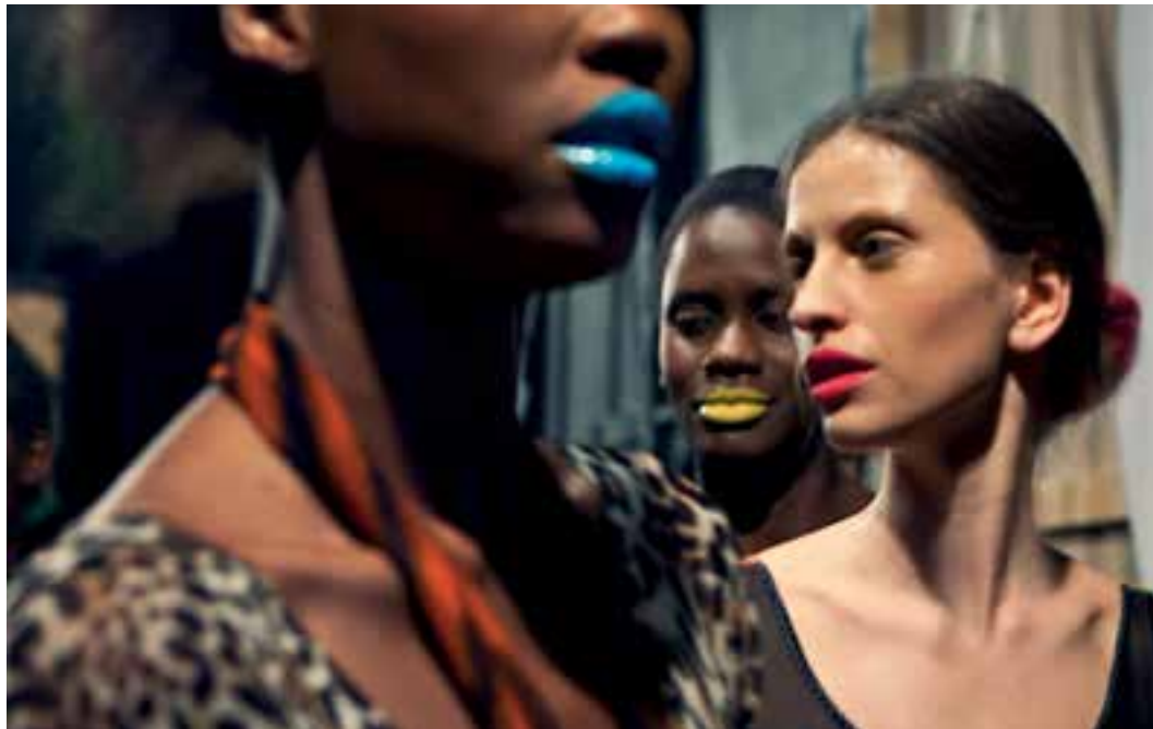
Models backstage at Mercedes Benz Fashion Week Africa, October 2012